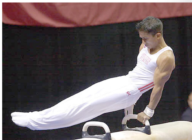
Our use of the term “gymnastics” includes all activities where the aim is body control.

While developing your upper body strength with the pull-ups, push-ups, dips, and rope climb, a large measure of balance and accuracy can be developed through mastering the handstand. Start with a headstand against the wall if you need to. Once reasonably comfortable with the inverted position of the headstand you can practice kicking up to the handstand again against a wall. Later take the handstand to the short parallel bars or paralleltes ( http://www.american-gymnast.com/technically_correct/paralleteguide/titlepage.html ) without the benefit of the wall. After you can hold a handstand for several minutes without benefit of the wall or a spotter it is time to develop a pirouette. A pirouette is lifting one arm and turning on the supporting arm 90 degrees to regain the handstand then repeating this with alternate arms until you’ve turned 180 degrees. This skill needs to be practiced until it can be done with little chance of falling from the handstand. Work in intervals of 90 degrees as benchmarks of your growth – 90, 180, 270, 360, 450, 540, 630, and finally 720 degrees.